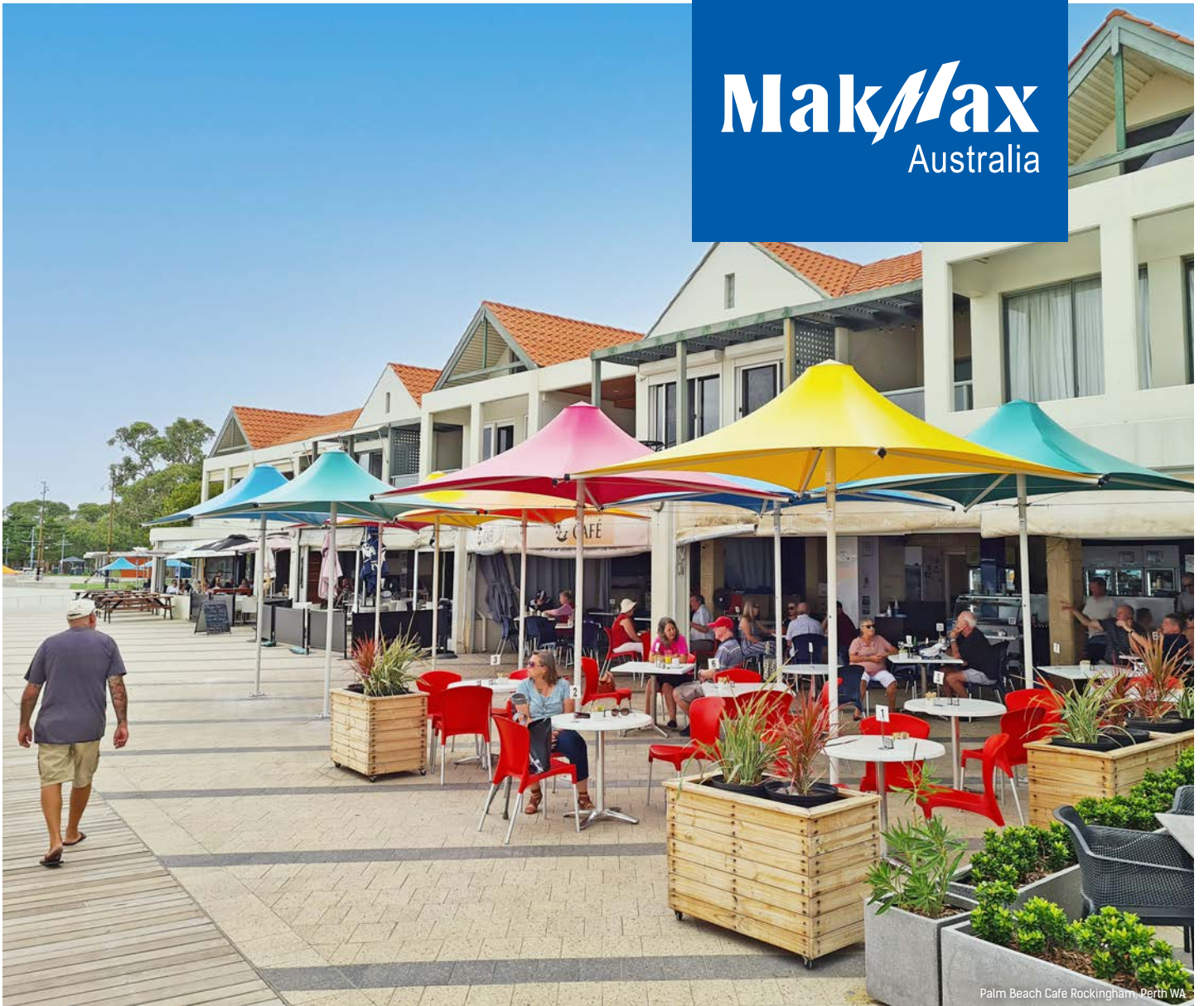
Palm Beach Cafe Rockingham, Perth WA